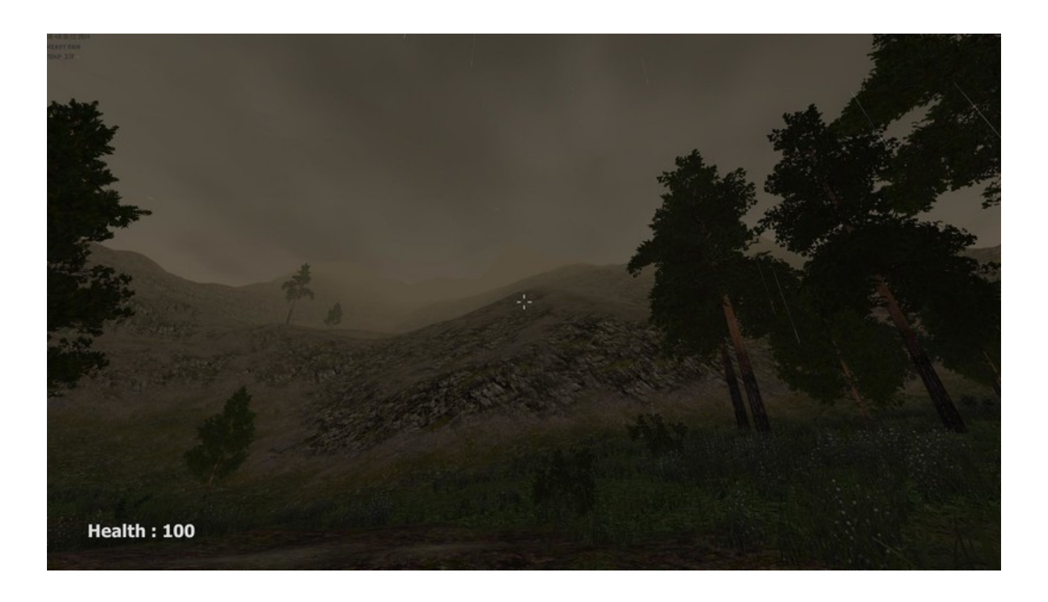
Who Am I: The Tale Of Dorothy Download Xbox 360 Free

Download ->>> <a href="http://bit.lv/2SHI1iR">http://bit.lv/2SHI1iR</a>